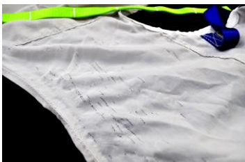
Small 'laddering' marks

Sling material may start to deteriorate over time. In the past we have seen damage to Slings caused deliberately by residents with dementia. General wear and tear may include small laddering in the material, or the Sling may be fraying in some areas. Although small amounts of laddering and fraying may be visible, this might not necessarily mean the Sling needs to be replaced. Facilities should be familiar with the amount of general wear and tear which is acceptable and safe, and can contact Pelican if there is concern. Large amounts of laddering and fraying may be a sign that the Sling is coming to the end of its useful life, and should be replaced.